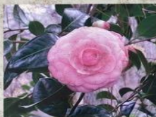
Camellia 'Sally B.'

Camellia varieties are categorized by flower form, rather than color ( Camellia japonica has over 50,000 named cultivars). Notice the differences in petal arrangement among Camellia japonica 'Sally B.', 'Debutante', and 'Tricolor' compared to the single flower of Camellia sinensis (the species used for black and green tea).